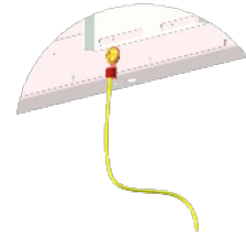
4210 clean earth